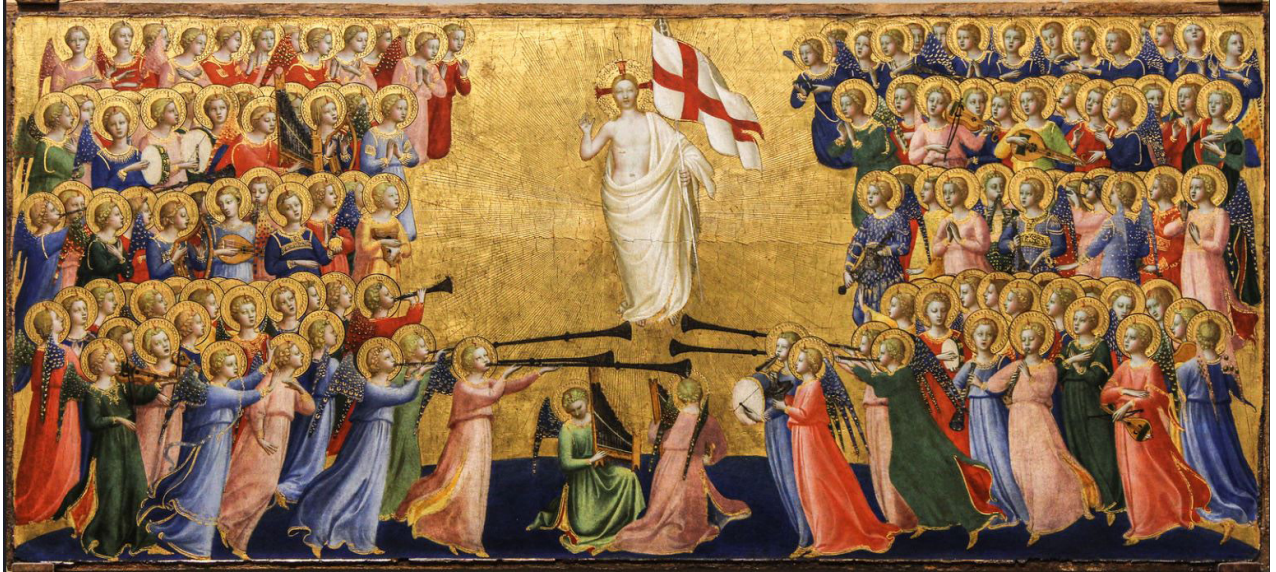
Christ Glorified in the Court of Heaven, Fra Angelico (15th century), from the Fiesole San Domenico Altarpiece

WELCOME - Thank you for being here this morning. Our prayer is that all who gather here will encounter the love of God, the grace of our Lord Jesus Christ, and the fellowship of the Holy Spirit. If you are visiting with us, (1) please be sure to fill out a visitor card located in the seat rack in front of you, (2) drop it in the offering basket at the Offertory, and (3) pick up a visitor's bag at the welcome table before you go. Come back and worship with us again!